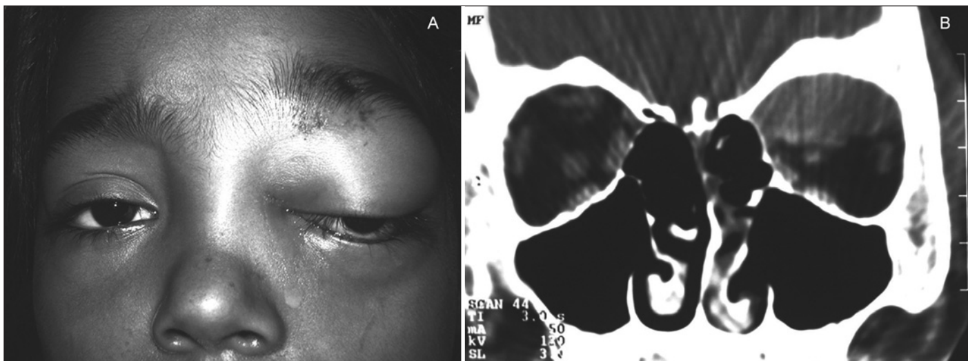
Figure 1 - A: Non-axial left eye proptosis and upper eyelid edema immediately after frontal trauma. B: Coronal computed tomography scan immediately after trauma. Notice in this soft-tissue window a large subperiosteal hematoma and an enlarged left frontal bone.

Relatamos o caso de uma menina de 11 anos com doença falciforme, trazida à sala de emergência após ser atingida por um bloco