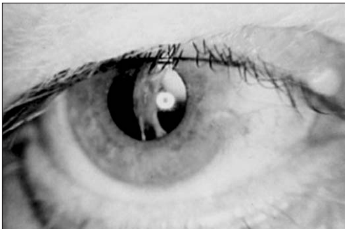
Figure 1 - Slit-lamp photograph of nasal and inferior subluxation of a right eye IOL two years after extracapsular cataract extraction. Note IOL dislocation within the thickened and contracted capsular bag

The capsular contraction syndrome manifests as an exaggerated reduction of the opening of a previous anterior capsulotomy and of the diameter of the equatorial portion of the capsular bag after cataract surgery. It may be due to a contraction caused by fibrous metaplasia of residual epithelial cells of the lens